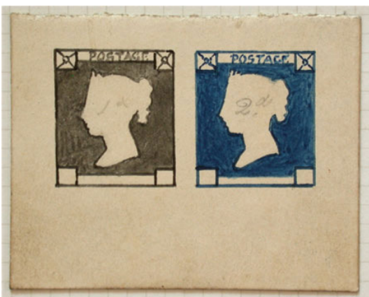
This image reproduced by the gracious permission of Her Majesty Queen Elizabeth II to whom copyright belongs.

Postage was too expensive—well beyond the reach of working families. Businesses increasingly saw the high rates as an obstacle to further growth. Postage also varied greatly, depending on the distance a letter was sent and how many pages it contained. Most mail was sent postage due, so the Post Office transported many letters that were never accepted or paid for.